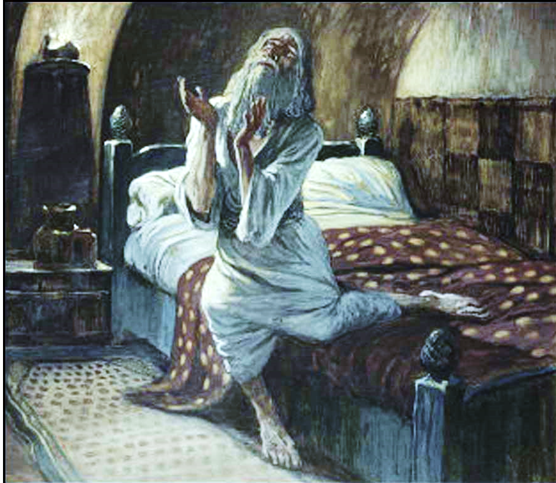
David Praying in the Night , James J. Tissot (1896-1902), The Jewish Museum, New York.